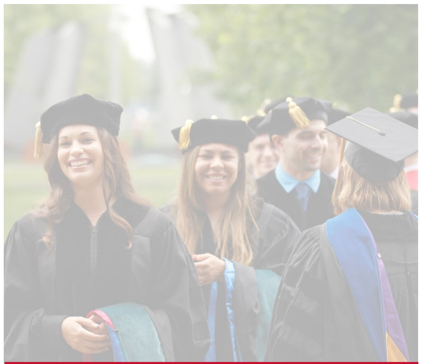
CHART YOUR COURSE:

A Guide to Graduate School at Fresno State