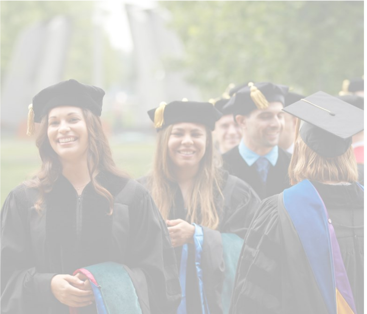
CHART YOUR COURSE: A Guide to Graduate School at Fresno State